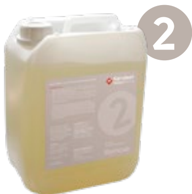
Karndean Basic Stripper 5 litres | 250m 2