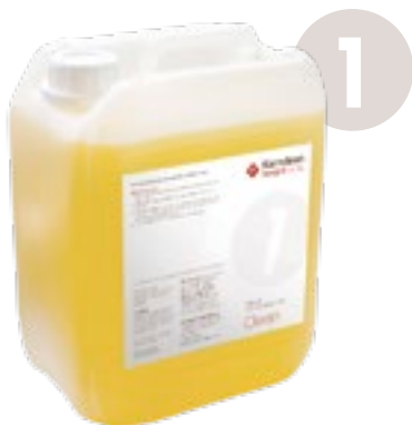
Karndean Routine Cleaner 5 litres | 1250m 2

Karndean floors are very hard wearing, but as with any flooring they need to be looked after and they can be scratched by grit and other sharp objects. There are many ways to protect your Karndean floor and prevent damage, though. We recommend following our Cleaning & Maintenance instructions and reading our Maintenance Advice for helpful hints and tips on how to look after your floor.