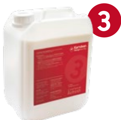
Karndean Refresh Hard 5 litres | 90m 2

Our specially formulated cleaning and maintenance products are designed to provide an easy and effective way to ensure our floors are kept looking and performing their best.