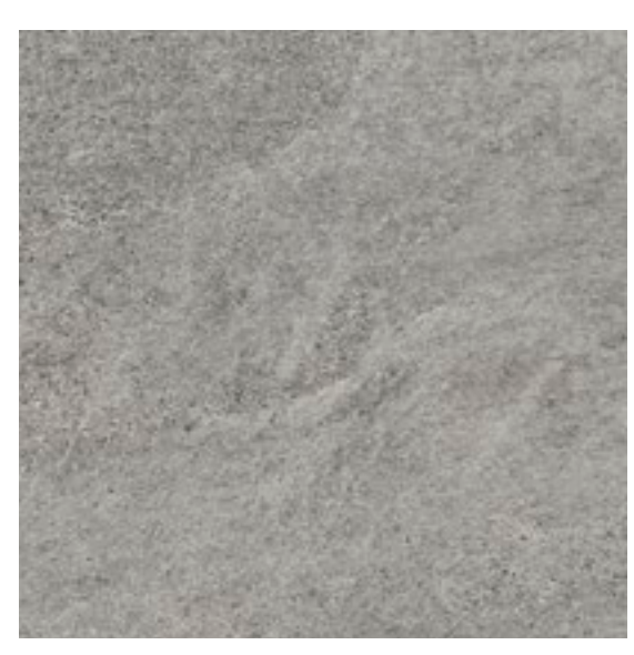
Sterling Quartzite Gluedown LM51 | Rigid Core AKT-LM51