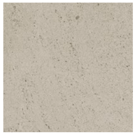
Caliza Classico Gluedown LM39 | Rigid Core AKT-LM39