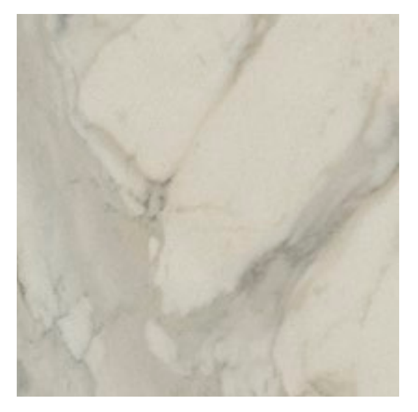
Calacatta D'Oro Gluedown LM33 | Rigid Core AKT-LM33