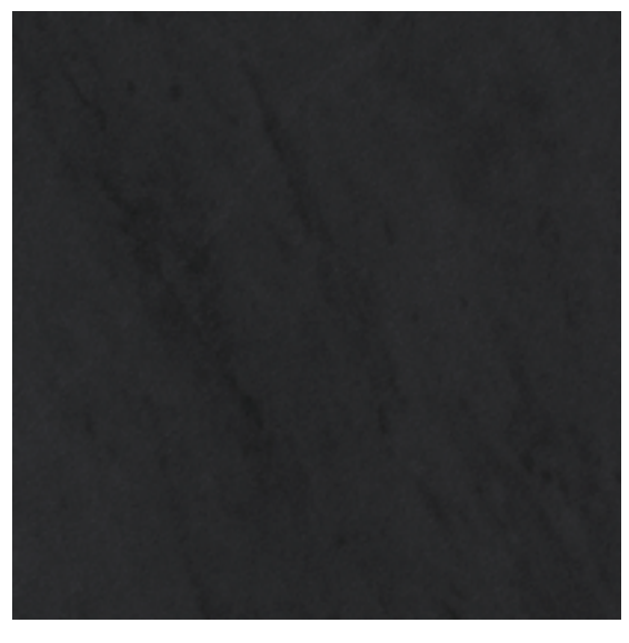
Corinthian Marble Gluedown LM31 | Rigid Core AKT-LM31