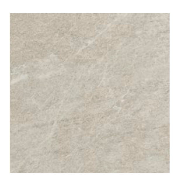
Alpine Quartzite Gluedown LM50 | Rigid Core AKT-LM50