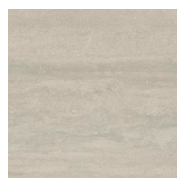
Silk Travertino Gluedown LM37 | Rigid Core AKT-LM37