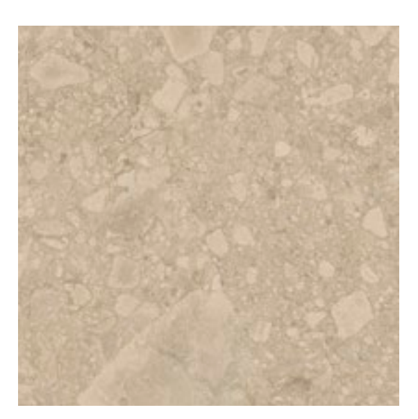
Sabbia Ceppo Gluedown LM44 | Rigid Core AKT-LM44