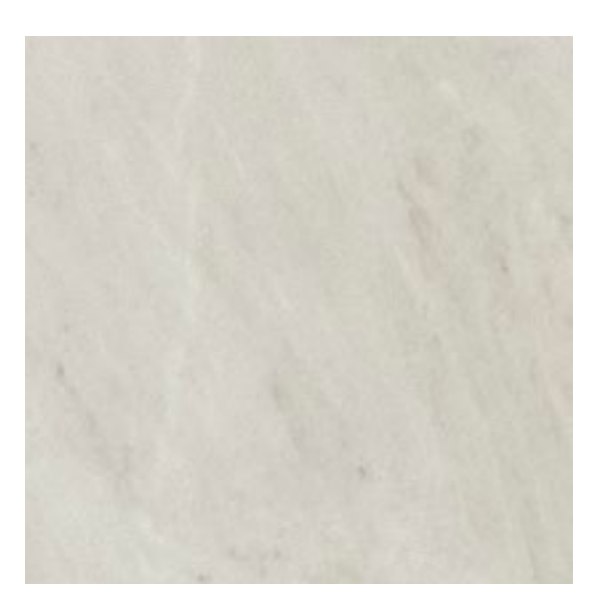
Doric Marble Gluedown LM32 | Rigid Core AKT-LM32