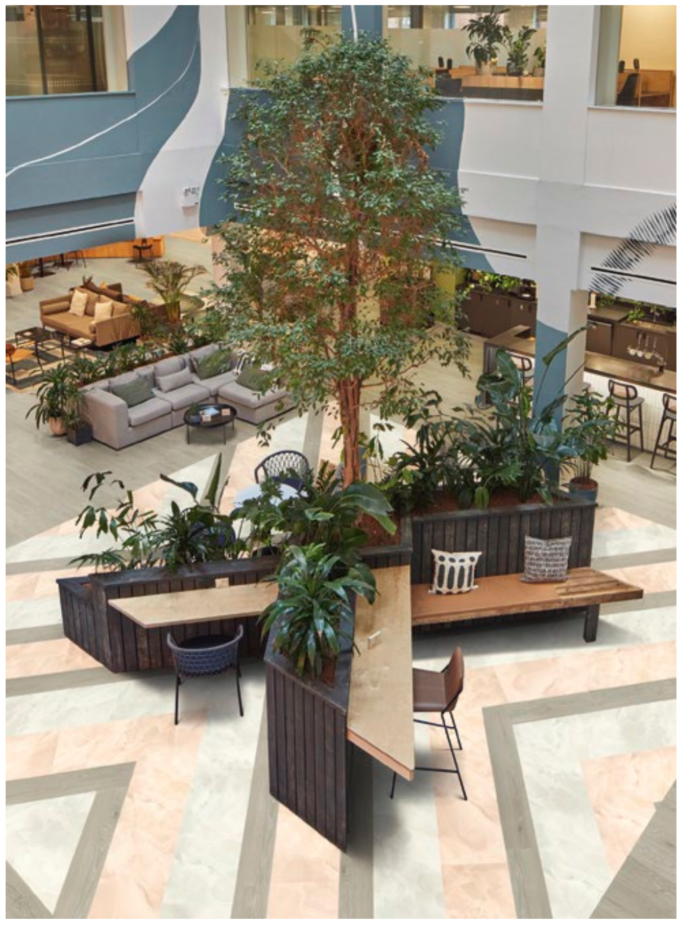
Combine stone and wood designs in gluedown to create a sophisticated, one-of-a-kind look. Pearl Onyx LM35 | Rose Onyx LM36 | Dove Artisan Oak RL30 (Art Select Wood)