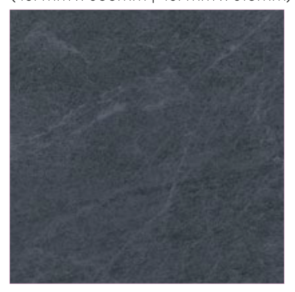
Lago Quartzite Gluedown LM49 | Rigid Core AKT-LM49