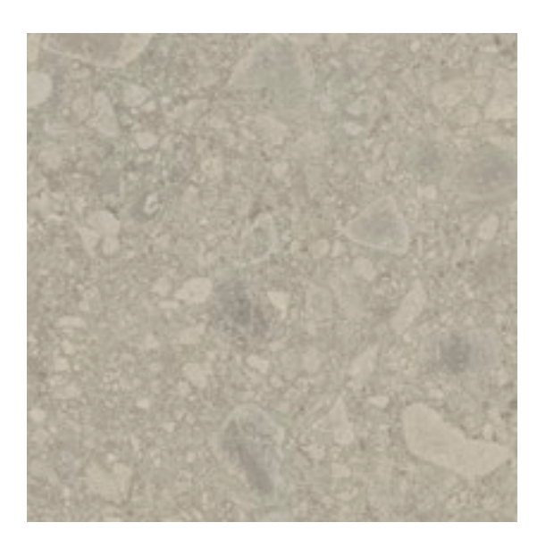
Brezza Ceppo Gluedown LM43 | Rigid Core AKT-LM43