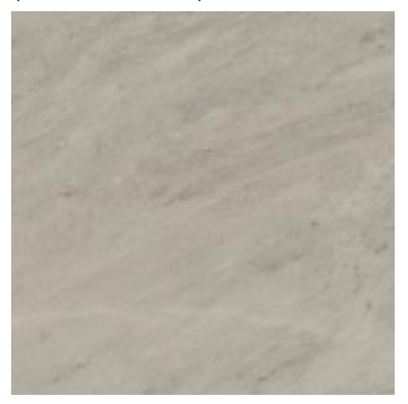
Ionic Marble Gluedown LM30 | Rigid Core AKT-LM30