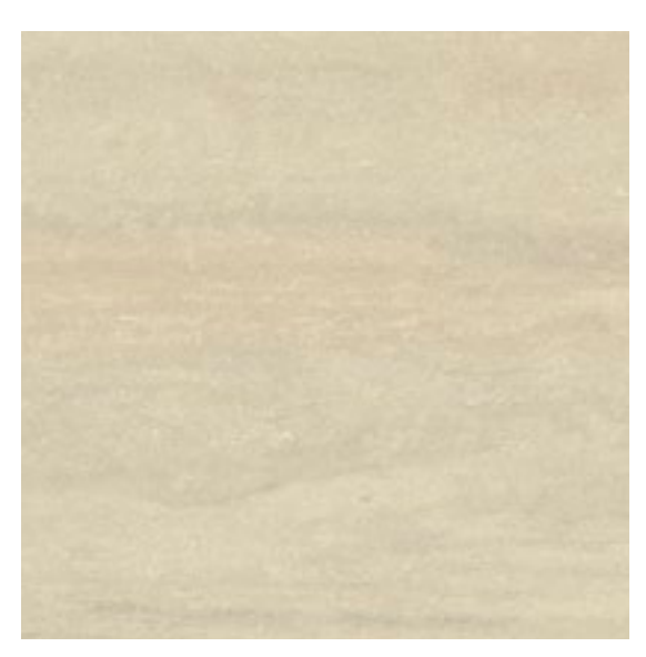
Champagne Travertino Gluedown LM38 | Rigid Core AKT-LM38