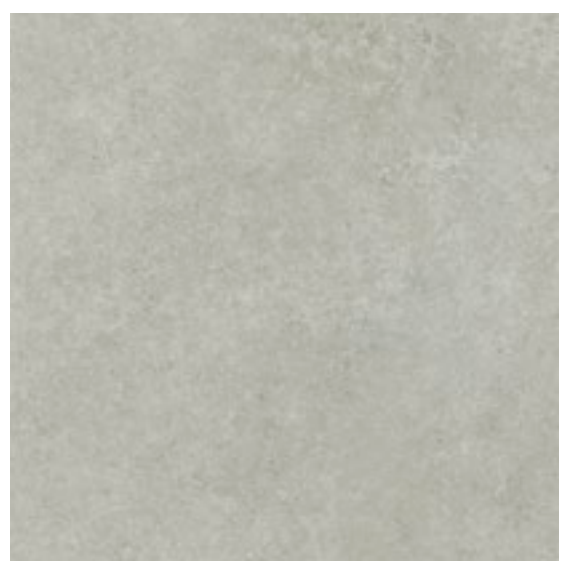
Pavimento Bianco Gluedown LM42 | Rigid Core AKT-LM42