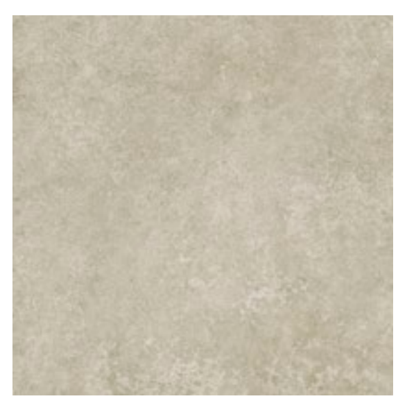
Pavimento Crema Gluedown LM40 | Rigid Core AKT-LM40