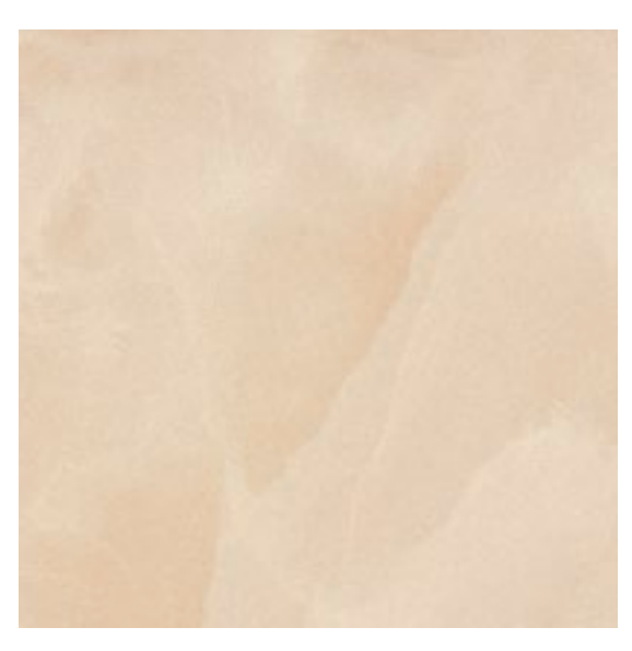
Rose Onyx Gluedown LM36 | Rigid Core AKT-LM36