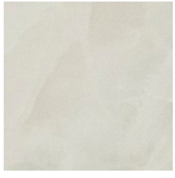
Pearl Onyx Gluedown LM35 | Rigid Core AKT-LM35