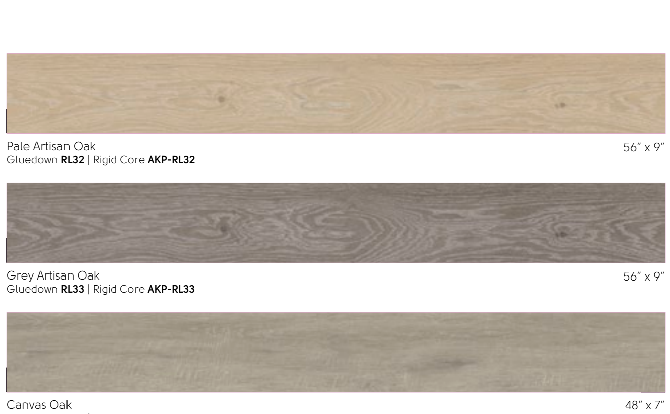
Gluedown RL34 | Rigid Core AKP-RL34