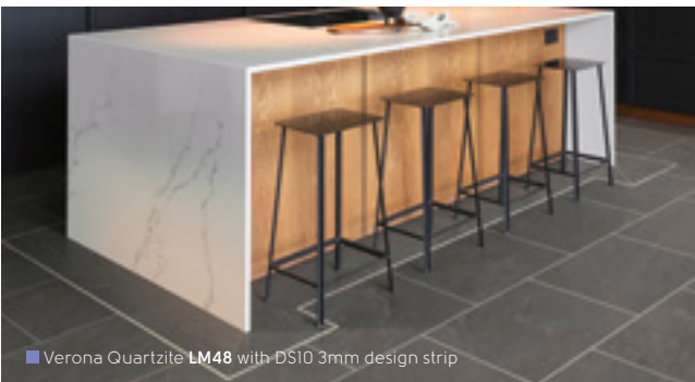
Verona Quartzite LM48 with DS10 3mm design strip